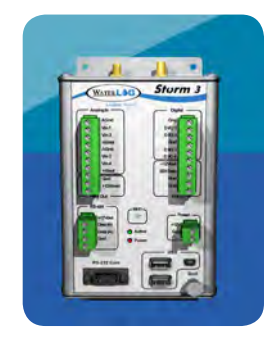
WaterLOG Storm 3 wireless telemetry. Real-time data monitoring.