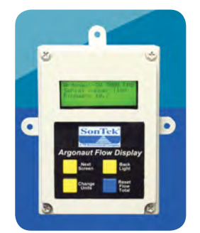
Easy-to-use Argonaut Flow Display for viewing SL500 data and system status.