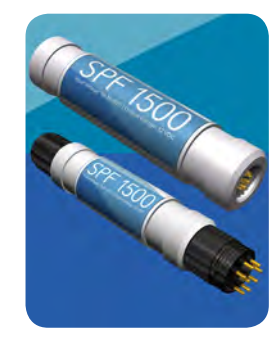
SPF1500 protects against fluctuations in power and communications over long cable lengths.