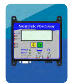
Easy-to-use SonTek Flow Display for viewing SL (3G) data and system status.